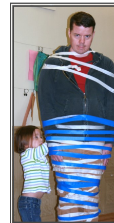
AND he's a great participant!